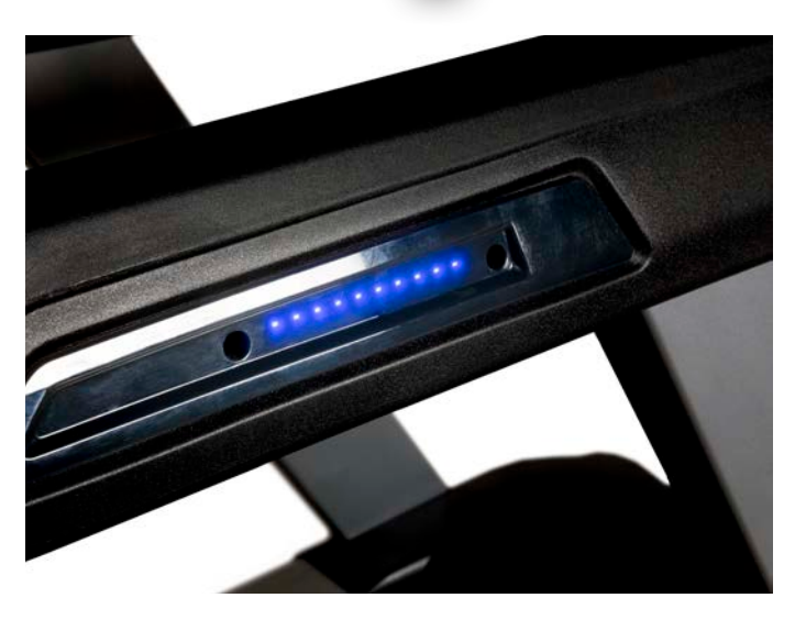
Light indicators. At a glance, the user can see whether the equipment is in use.