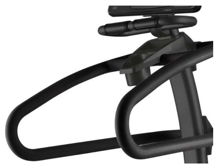
Ergonomic handlebar. The handlebar, which has been designed for the best biomechanics, allows the machine to be adapted to people of any height.